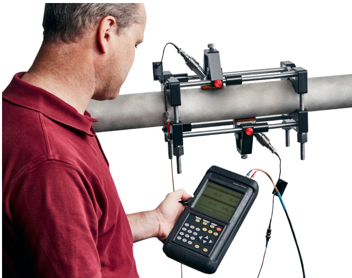
Optional pipe wall thickness gauge

Pipe wall thickness is a critical parameter used by the TransPort PT878GC flowmeter for clamp-on flow measurements. The thickness-gauge option allows accurate wall thickness measurement from outside the pipe.